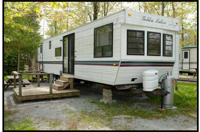
Golden Falcon - 36' - sleeps 6